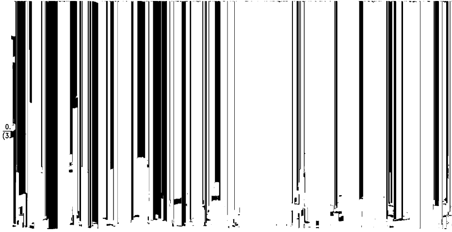
16-Lead (0.300× Wide) Molded Dual-In-Line Package (P) NS Package Number N16E